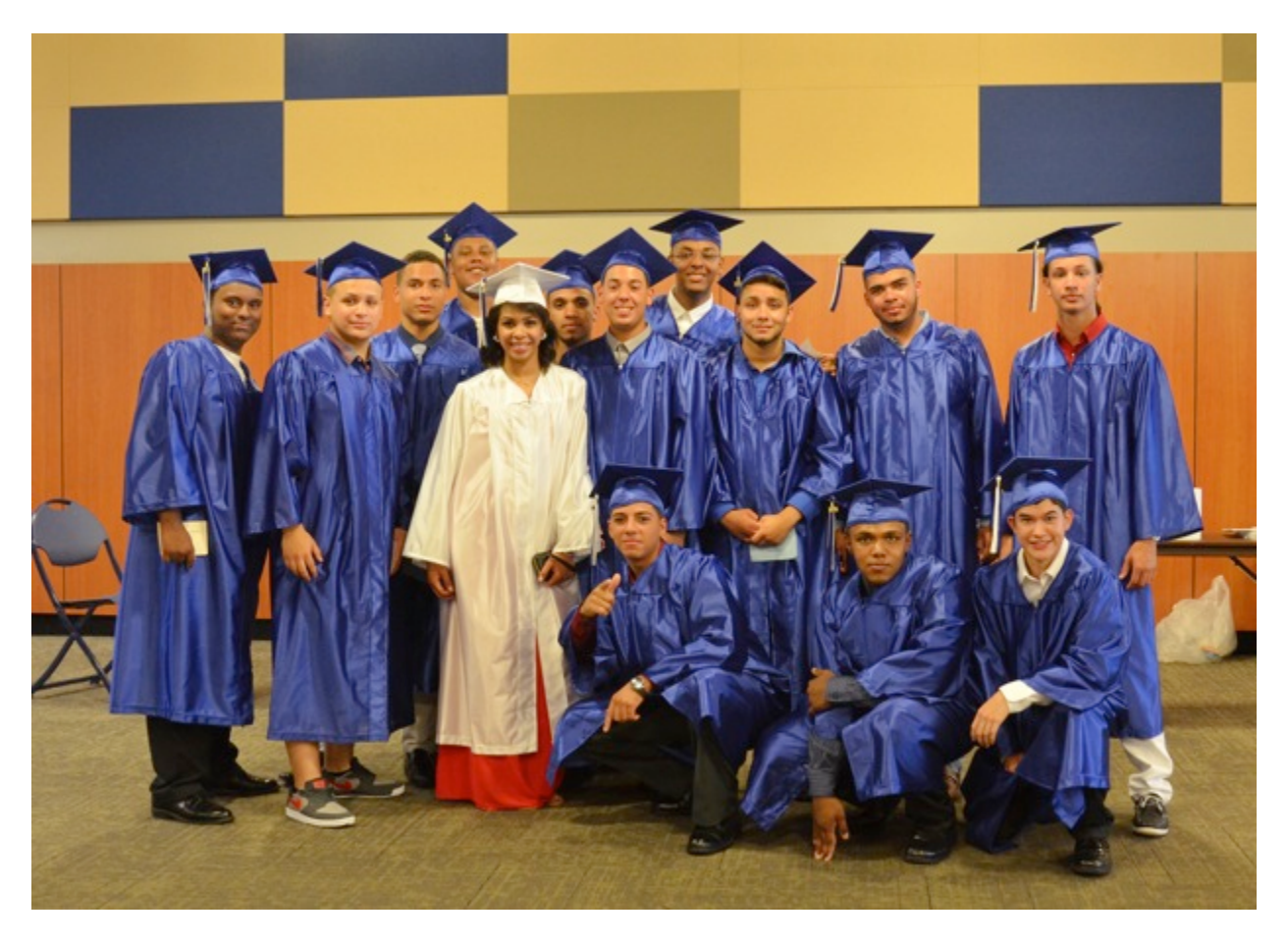
Photo Caption 0024: Students of the School of Construction Technology pose for a pregraduation photo.

This year's graduation boasted the extraordinary accomplishments and achievements for students and staff. The Class of 2014 is bound to achieve great success. Congratulations to all and good luck in the future!