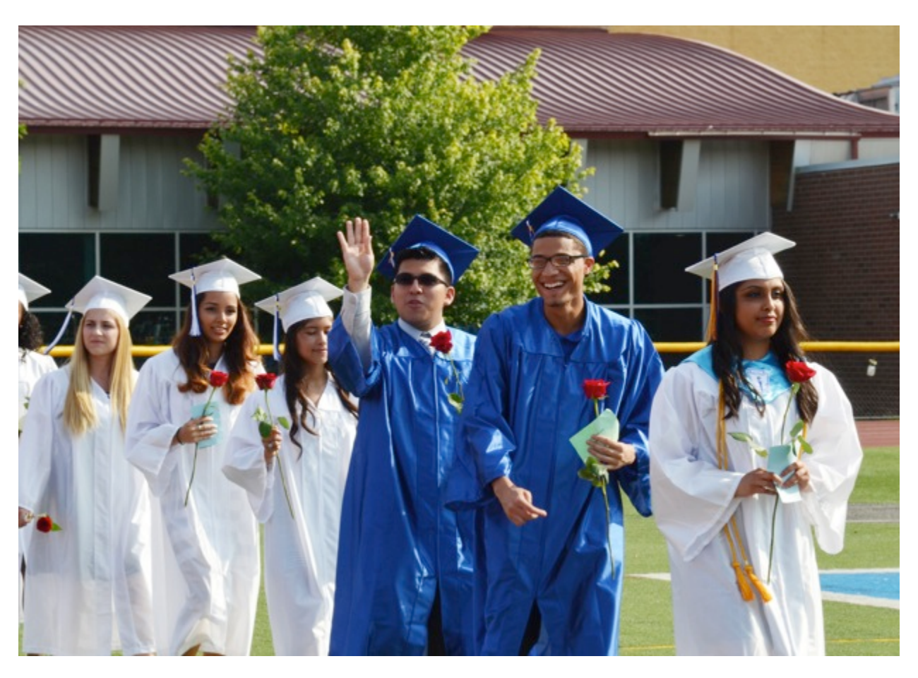
Photo Caption 0116: PCTI seniors receive their diplomas at the school's 50<sup>th</sup> graduation ceremony.